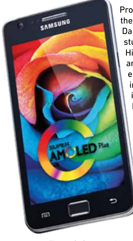
Figure 2: Samsung's Galaxy S smart phone with its Active Matrix OLED display (3).

The patterning of each pixel has been problematic since the inception of the OLED displays as